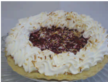
White Coconut Raspberry Cream