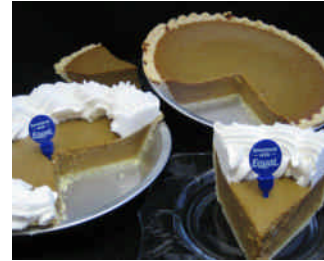
Pumpkin—Plain or Whip Topped Regular or No Sugar-Added

Great ways to celebrate National Pie Day: